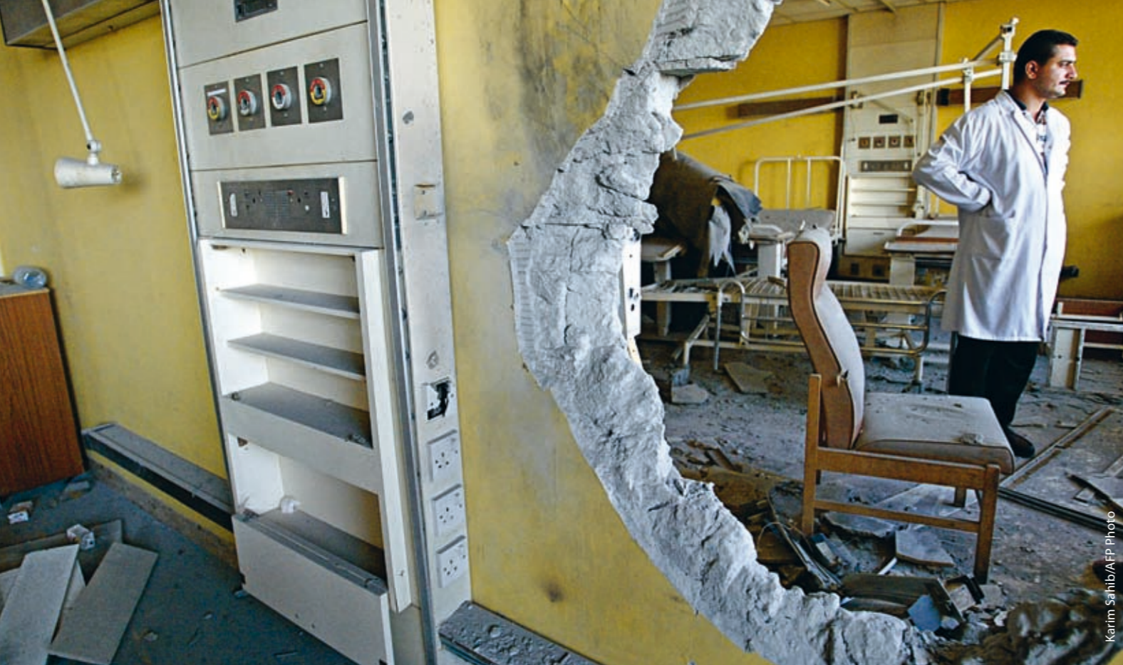
A doctor surveys the rubble left in the Adnan Khairallah Hospital in Baghdad after it was hit by a missile.