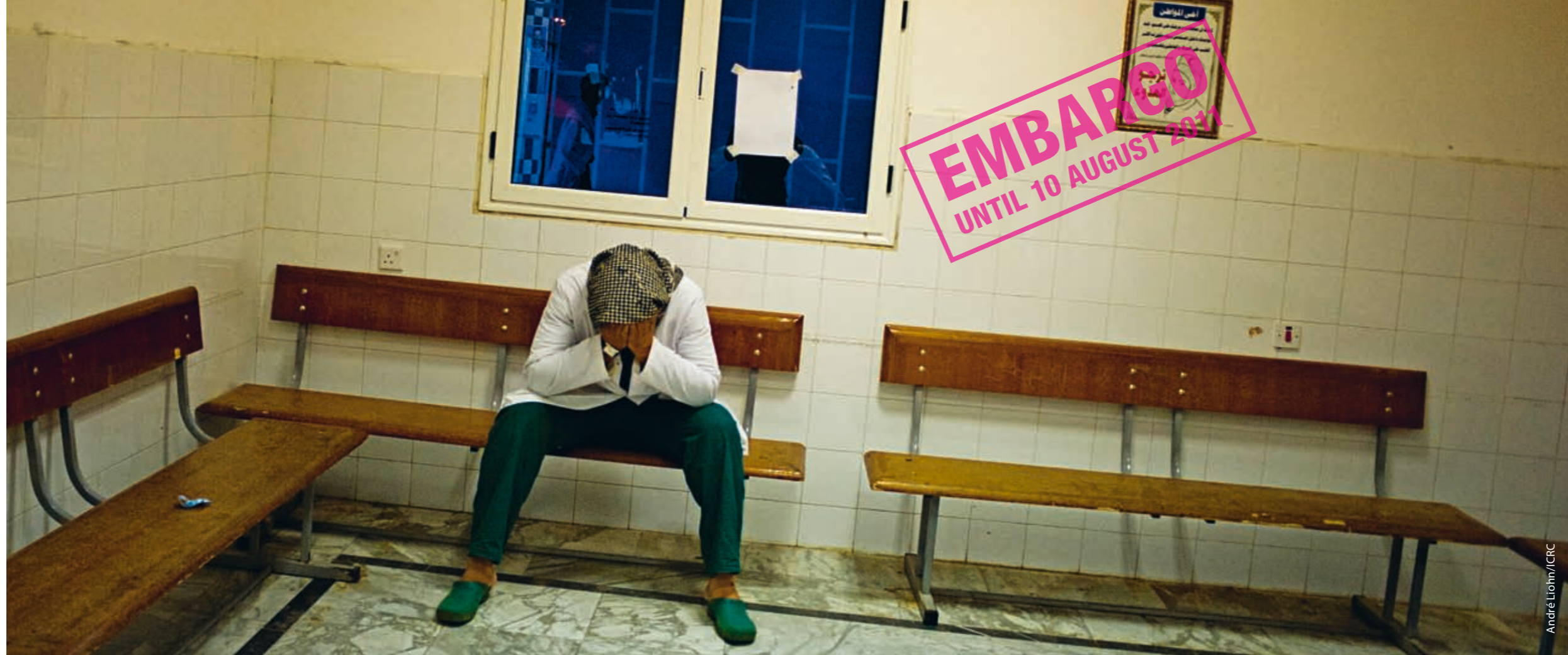
A doctor cries for four of his colleagues – a doctor, an ambulance driver and two nurses – who were killed by an air strike on the road between Ajdabiyah and Brega in Libya.