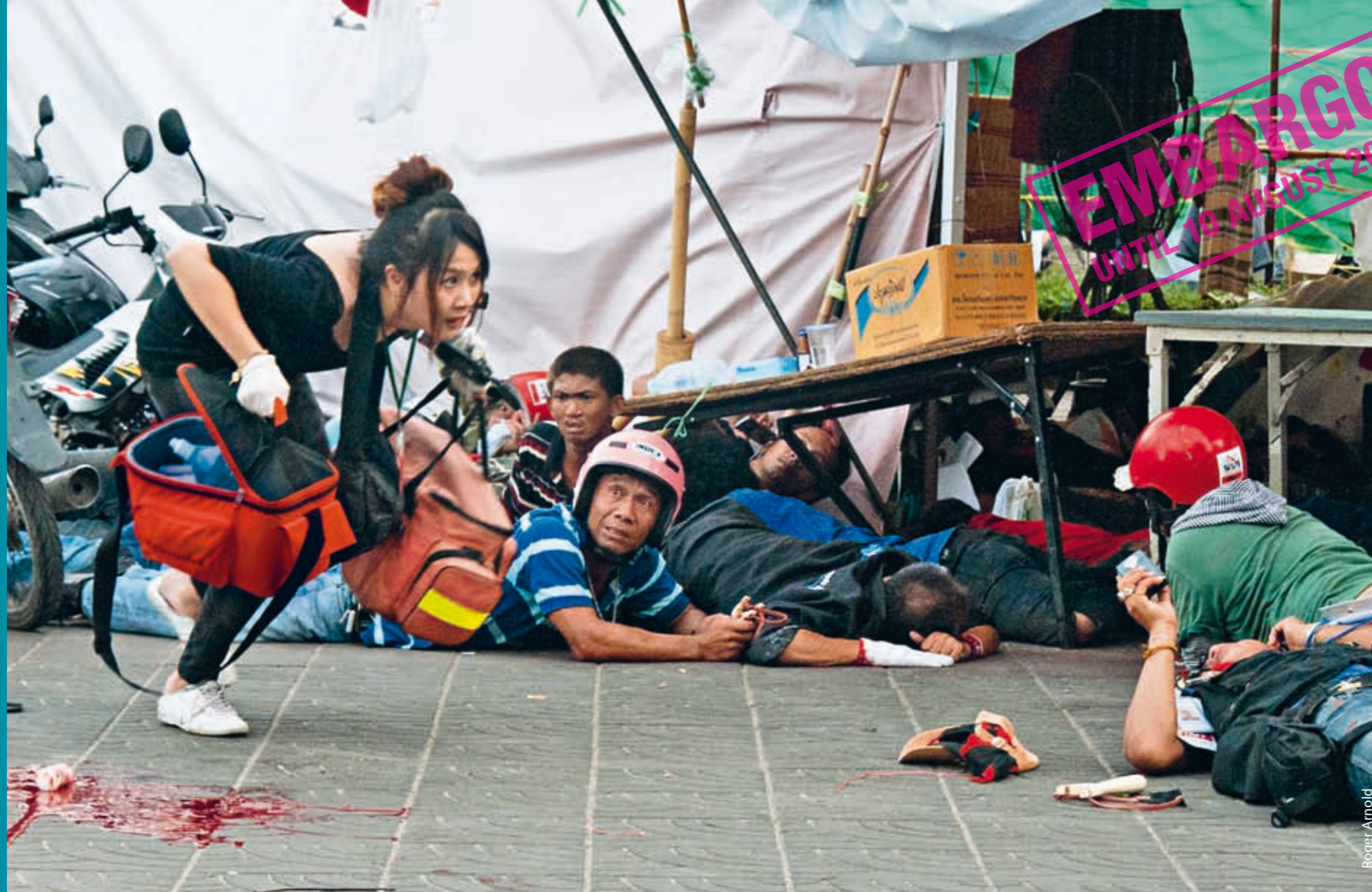
Health-care personnel who give life-saving assistance to the injured are often at risk themselves.

On occasion, health-care personnel have also been arrested for carrying out their professional responsibilities to treat all in need regardless of who they are and what they have done. Three doctors who had been working in northern Sri Lanka were detained in mid-2009; Red Crescent volunteers in Yemen were detained on suspicion that they sympathized with protesters during the unrest in early 2011; and in Bahrain, 47 doctors and nurses who treated protesters have been detained in sweeping arrests of health workers that followed the crackdown on protesters and face trial in a military court on a range of other accusations.