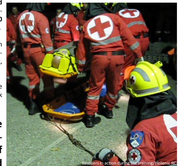
Rescuers in action during the training

"We are proud of owning the biggest volunteer rescue and first aid force in Greece. We made a revolution in the standards