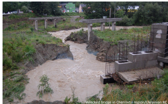
Wrecked bridge in Chernivtsy region

CHF 244,126 has been allocated from the IFRC's DREF to support the National Society in delivering immediate assistance to some 3,500 people (1,200 households). IFRC representative for Ukraine, Joe Lowry, noted "these regions are essentially still recovering from the massive floods of 2008. "Fortunately, the local branches are well prepared and have a good working relationship with the local authorities.