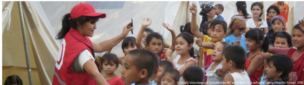
(Detail) Volunteer of Uzbekistan RC with kids in a refugee camp

The IFRC's emergency appeal for CHF 4.15 million, launched on a preliminary basis on 16 June 2010, initially aimed at bringing emergency relief to 24,000 of the most vulnerable people in the camps