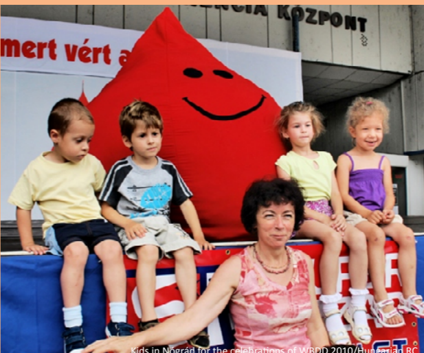
Kids in Nograd for the celebrations of WBDD 2010/Hungarian RC

New TV spots and good media coverage of events