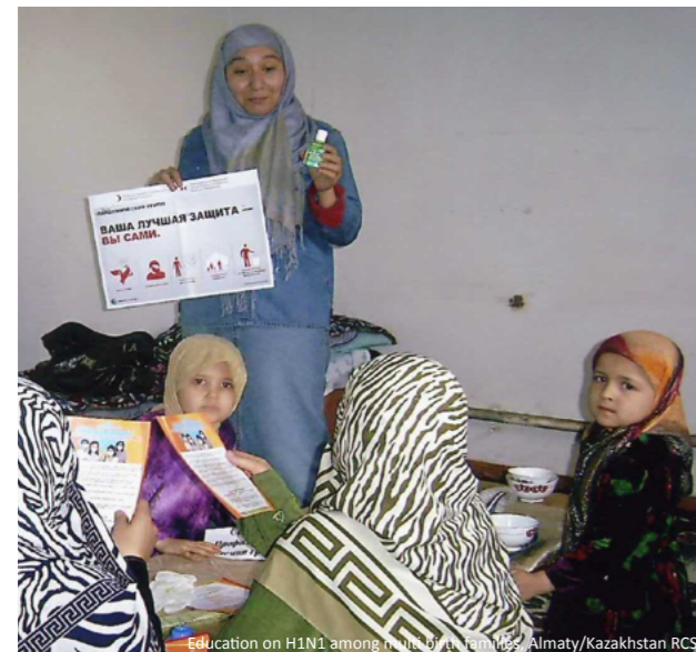
Education on H1N1 among multiple birth families, Almaty/Kazakhstan RCS

was developed, in order to measure the knowledge of participants before and after the training. Success was achieved, with awareness increasing from 45 to 85% . In all three