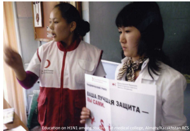
Education on H1N1 among students at medical college, Almaty/Kazakhstan RCS

The Kazakhstan RC took care of the preparation of, on the one hand, communication materials for public distribution, i.e. posters and brochures, which were distributed to the three branches involved in the project and, on the other hand, training materials for volunteers and staff, developed basing on the information from www.pandemicpreparedness.org .