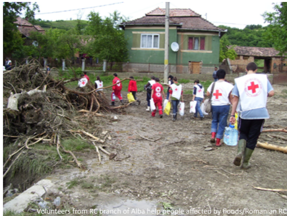
Volunteers from RC branch of Alba help people affected by floods

While the Ukraine Red Cross concentrates on humanitarian relief, local authorities are undertaking evacuations, restoring power supplies and checking flood defences. The Russian Ministry for Emergencies sent two transport planes with relief