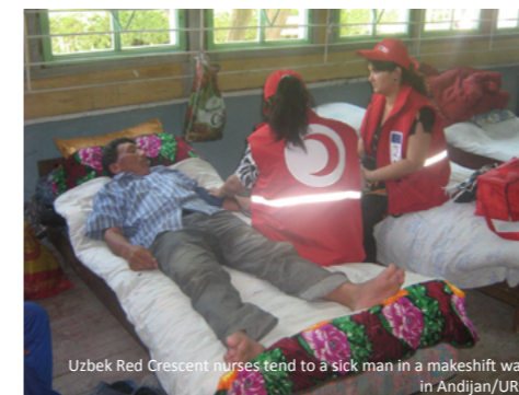
Uzbek Red Crescent nurses tend to a sick man in a makeshift ward in Andijan

As the humanitarian situation remains highly volatile, the Red Crescent Society of Kyrgyzstan, in partnership with the ICRC, continues to provide humanitarian assistance to the most vulnerable victims of the recent violence: it was among the first humanitarian agencies to provide assistance to the affected population through distribution of food and non-food items, medical supplies, hygiene items and materials to repair damaged houses. More than 5,000 individuals received blankets, jerry cans, food parcels. Totally 150 tents to returnees whose houses were burnt was distributed.