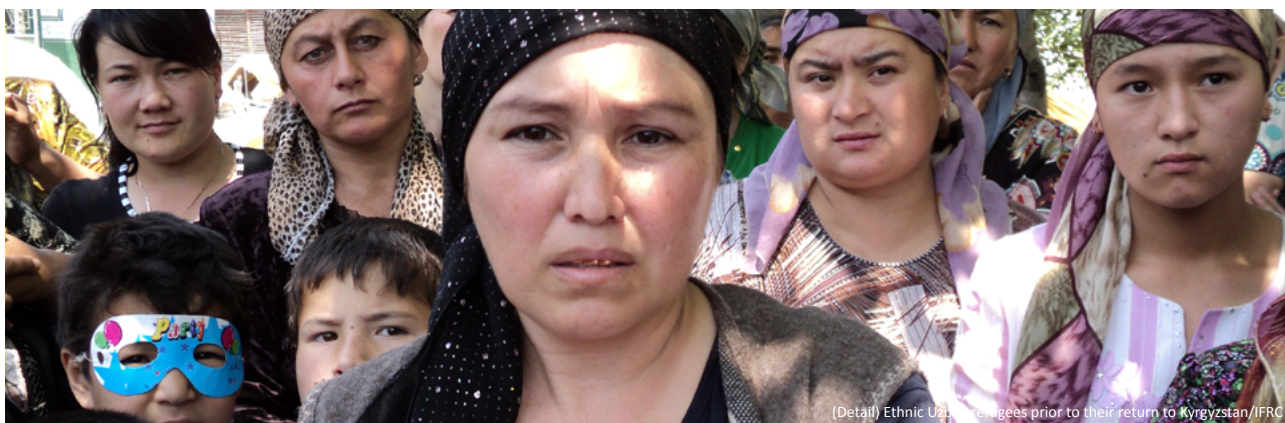
(Detail) Ethnic Uzbek refugees prior to their return to Kyrgyzstan/IFRC