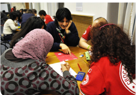
Youth participants to the Seminar on Forced Migration during the role-play Terra Game .