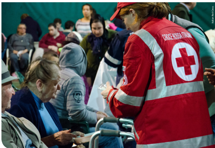
Volunteers from the Italian Red Cross were working around the clock to ensure families displaced by the earthquake are comfortable and safe.

Another strong earthquake with a magnitude of 5.6 hit the western part of Bulgaria early in the morning on 22 May. The epicentre of the earthquake was registered near the town of Pernik also affecting the country's capital, Sofia. All concerned services from the Joint Rescue System in the Republic of Bulgaria were activated and deployed immediately in the affected area to provide support to the population. The Bulgarian National Society worked on providing psychosocial support and distributing relief items to the affected population.