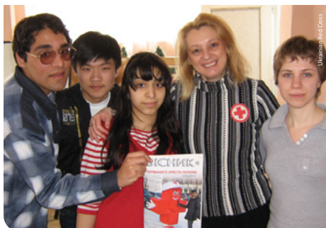
Ukrainian Red Cross volunteers together with young migrants.

"I arrived in Switzerland eight months ago, and today's the first day I'm doing sports since I had to leave my home country. I'm very happy", a teenager from Syria once told us.