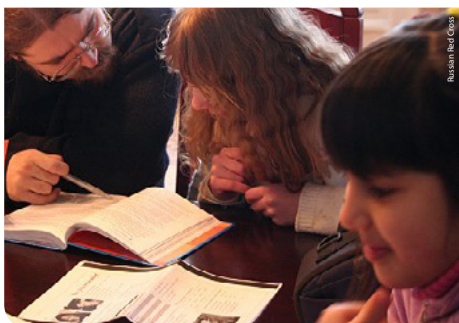
Migrant children while studying school subjects with the support of Red Cross volunteers.

For many years now, on Sundays, the Russian Red Cross Regional Branch in St. Petersburg has been meeting migrant people and their children in its Centre at 11, Millionnaya Street. Here, Red Cross volunteers and staff engage children in various forms of activities, ranging from maths and English language classes, to art therapy classes and organized city sightseeing trips. Children and volunteers draw with crayons in the streets, make snow sculptures not only for their own pleasure, but also to catch passers-by's attention to the problem of migrant families. Over the time, the Centre has developed an atmosphere where children learn how to communicate, trust and respect each other. Russian Red Cross staff and volunteers worked on the establishment of such a Centre where, while having fun, children can learn how to better communicate with other people, and reflect on their actions and feelings. Tutoring in the Red Cross Centre does not only mean assisting children in mastering different school subjects, but also in overcoming study-related accumulated fears and frustrations, and discovering that even a disliked subject can be fun. Attention is also given to adults; for them Red Cross staff organize "the club of communication", with tea parties and celebrations on national holidays. Recently it has become possible for adults to study the Russian language and literature.