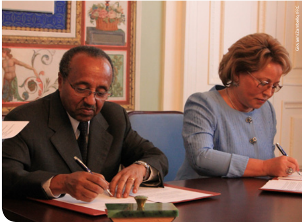
(from left to right) Mr Bekele Geleta, IFRC Secretary General and Ms Valentina Matviyenko, Chairperson of the IPA CIS Council, during the signing ceremony of the cooperation agreement between the IFRC and the IPA CIS.