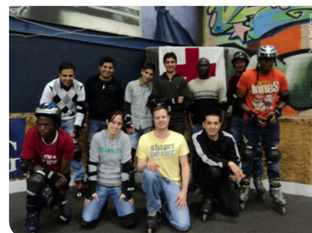
Young migrants and Red Cross volunteers during one of the outdoor sports activities organized by the Red Cross Youth of canton of Aargau.

In Switzerland, in September 2011, volunteers of the Red Cross Youth of canton of Aargau started a long-term project called Sports Days with Refugees. Once a month, youth volunteers launch a game or an outdoor activity that brings together people living in asylum seeker housing centers in the area and Swiss Red Cross Youth volunteers to compete together in different sports activities, like inline skating, volleyball and swimming. On a hiking tour or during a boat trip on one of the many Swiss rivers, refugees get to know the surrounding area and deepen their understanding of the host country. And last but not least, locals and people from abroad get together, share a good time and after the activity there's a lot to talk about, and participants can improve their knowledge of the German language that is spoken in that canton.