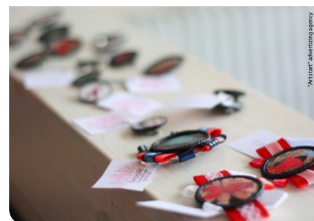
Young Belarusian designers, inspired by the charity event, created a collection of thematic handmade adornments and souvenirs. All the money raised during the event was directed to the centre for HIV-positive people in Zhlobin, Gomel Region.