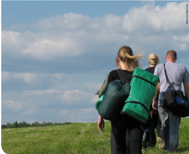
Belarusian Red Cross Youth participants to the fourth edition of "On the Run" in Belarus, held on 26-27 May.