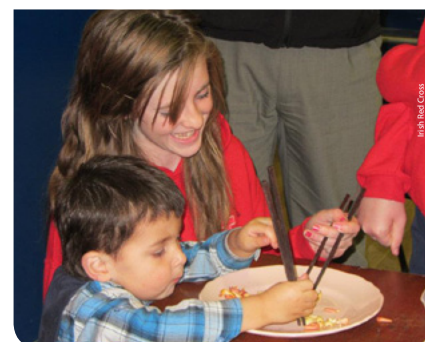
Learning how to use chopsticks. Intercultural evening.