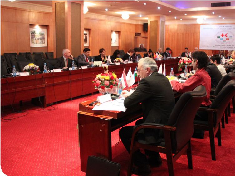
Presidents and secretaries general of the Red Crescent Societies of Central Asia, together with IFRC Secretary General, Director of Europe Zone, and ICRC regional delegates attended the Annual Central Asian National Societies' Leadership Forum in Dushanbe, 1-3 March 2011.

“Demographic challenges, migration, climate change, and globalization affect our people and communities with major consequences for our work. The International Federation of Red Cross and Red Crescent Societies should adapt to these changes in order to do better by increasing its capacity to provide humanitarian services to vulnerable communities and people in need.”