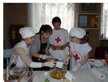
Bulgarian Red Cross volunteers and youngsters involved in one of the activities held in the protected house

The second major part of the project consists of the establishment of a protected home for youngsters who are leaving different social institutions when they become of age. That is considered to be a key step towards their successful reintegration in society and the development of their social and professional skills. The capacity of the home is 12 people, each of whom is allowed to stay no longer than a year. Another goal is to deliver suitable training courses for the youth and provide them with the opportunity to access internship programmes. All youngsters who are living in the protected home will also be able to join the activities of the Bulgarian Red Cross Youth and work together with the volunteers of the National Society.