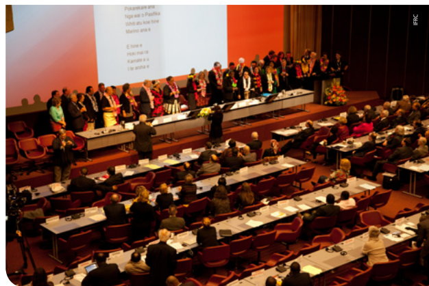
31st International Conference of the Red Cross Red Crescent.

The 18th General Assembly , which was marked by the official admission of the Maldivian Red Crescent Society into the IFRC, had Humanitarian Diplomacy, Road Safety, Community Resilience, Resource Mobilization, Gender Equality and a Culture of Non-Violence and Peace as the main topics addressed by the 180 National Societies.