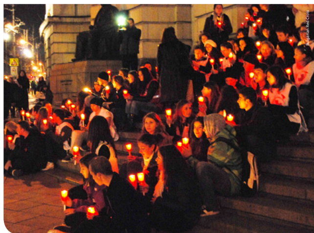
Bulgarian Red Cross Youth volunteers during the candlelight memorial held at the end of the public campaign. Heading in a silent walk to Sofia University, volunteers lit candles and shaped to form a human red ribbon.