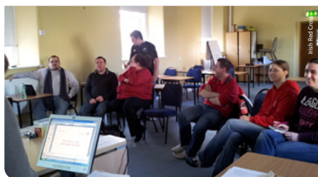
Members of the Irish Red Cross NYWG being trained at the launch of Irish Red Cross Youth's HIV Awareness Programme.

Irish Red Cross Youth marked World AIDS Day this year by launching their HIV Awareness Programme on 3 December - a programme which was the winner of this year's International Federation Youth Award in the category of "Healthy youth make a healthy world". The programme aims to reach approximately 50% of Irish Red Cross Youth members in 2012 with information on HIV and its prevention, as well as fighting stigma towards people living with HIV. It empowers youth to become peer