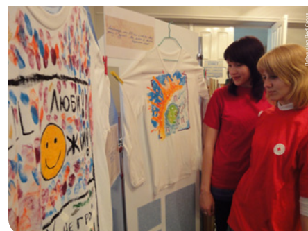
Belarusian Red Cross youth volunteers at the official opening of the exhibition "A city where people live" in Lida town (Grodno region) dedicated to the World AIDS Day.

Another event dedicated to 1 December was the official opening of the exhibition 'A city where people live' in Lida town, Grodno region, organised in cooperation with the Belarusian Community of People Living with HIV. According to one youth volunteer of the Belarusian Red Cross: "After my work at the exhibition, my attitude towards people living with HIV changed radically. I think that my peers have also transformed their attitude to the problem: I saw their on their faces and in their eyes when they were reading the letters by HIV-positive people."