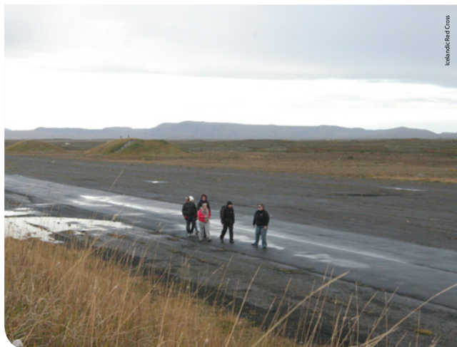
Youth participants during the training hosted by the Icelandic Red Cross in September. During the game participants experience insecurity, distrust, fear, exhaustion and other feelings commonly known to those on the run. They feel unwelcome, victims of bureaucracy and prejudice, dependent on humanitarian aid and at the mercy of people who have no respect for them.