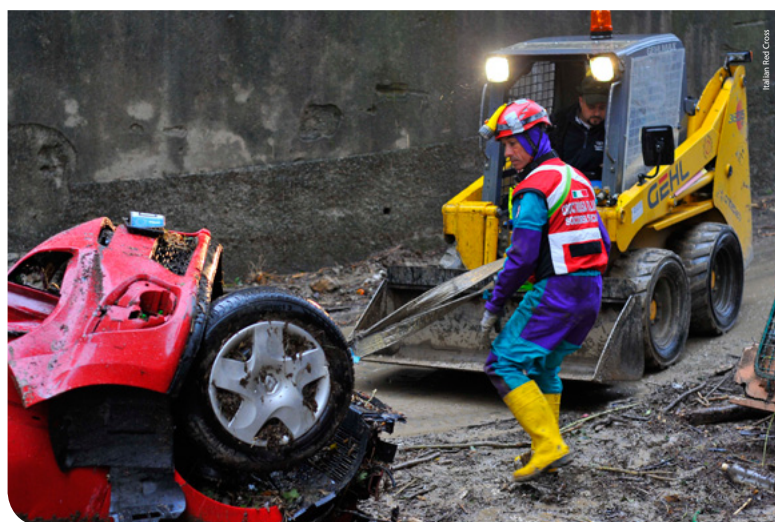
Italian Red Cross volunteers during the clean-up operations in Genoa, following the flash floods which affected large parts of north-west Italy.

On 16 November, a Revised Appeal based on the joint needs assessment of the affected population conducted by the Turkish Red Crescent in cooperation with local authorities was launched.