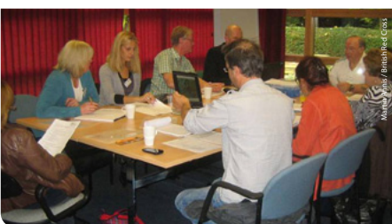
ENPS Steering committee on the preparation of the forum.