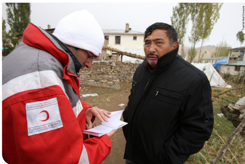
Turkish Red Crescent action after a powerful earthquake, magnitude 7.2 shook southeastern Turkey on October 23 2011, triggering the collapse of buildings and killing scores of people.