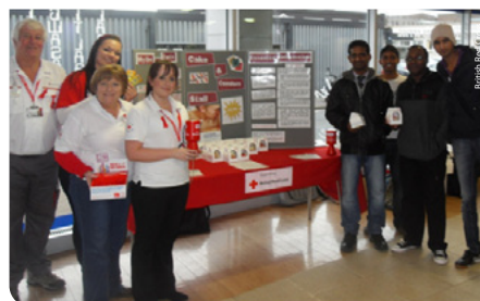
Red Cross student volunteering group with cake and condom stall at Glyndwr University.

A Student Volunteering Group of the British Red Cross in Wales took part in a Cake and Condom stall at Glyndwr University in Wrexham to raise awareness of HIV and AIDS. The group made a total of 100 cupcake boxes to sell on World Aids Day. Each cupcake box contained a cupcake, a World AIDS Day ribbon, statistics about HIV and AIDS, and a condom as a way to promote safer sex, in a context where 90% of infections come from sexual contact. Many students were shocked to learn that 20 people in the UK were diagnosed with HIV everyday.