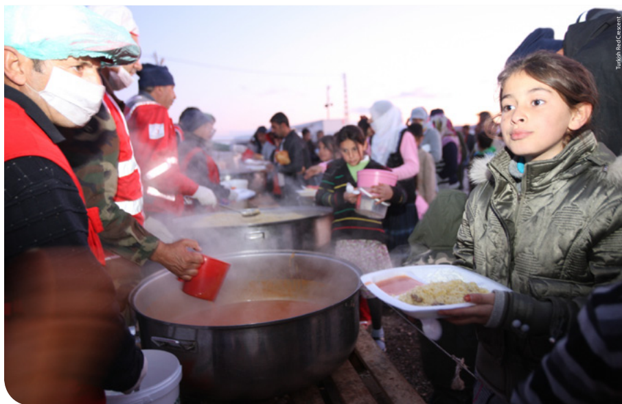
Turkish Red Crescent has been providing hot meals to people living in the tent cities in Van and Erzurum.

The International Federation's Europe Zone office is in regular contact with the Turkish Red Crescent, which has been leading the operational response on the ground since the first minutes after the disaster. Daily telephone conferences have been organised with the management of the National Society and with its operational and crisis centre teams, to facilitate the coordination of the response activities. Information is regularly shared with the Turkish National Society about donor contributions. The Turkish Red Crescent Society has been issuing daily operations updates and providing additional information to the International Federation's Europe Zone office. The International Federation's Global Logistics Services (GLS) are managing the mobilization of in-kind contributions and are interacting with the partners.