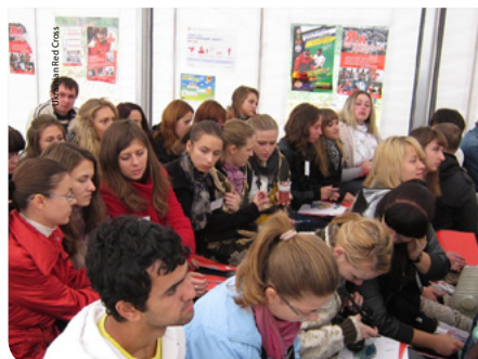
Ukrainian Red Cross Youth participants to the Assembly during one of the sessions.

"Our Youth Assembly has become that moving force for the Ukrainian Red Cross Youth that we all anticipated for" said Inna, one of the youth participants.