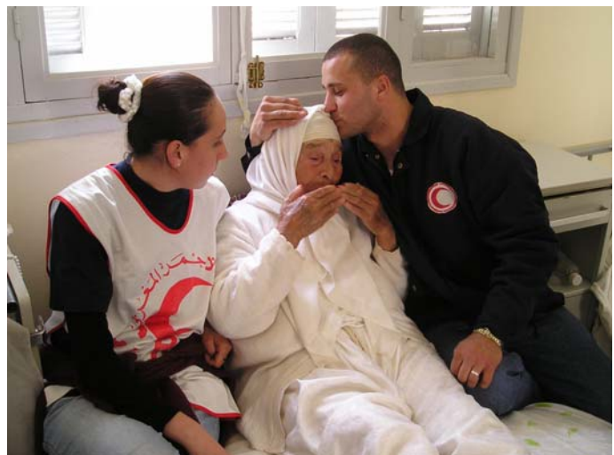
First prize: Humanité , by Abdessamie Elkabir (Morocco)

Exposed were also the best pictures of the 4 th photography contest launched by the CCM. There was an exhibition of 15 pictures selected among all the pictures received for the contest under the theme " Youth across the borders: one click for one change ", portraying the humanitarian values and the principles of the RC/RC.